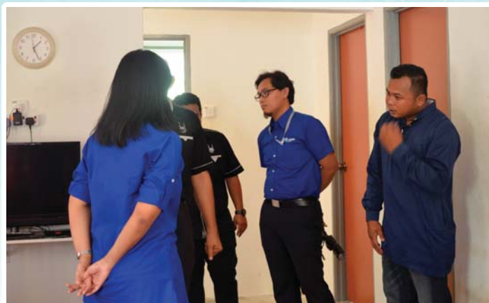
MBSB Bank Berhad and IRM visiting the house of beneficiary