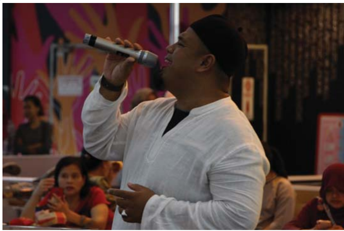
Afad performing at Tazking Semarak Patriotik and Cinta Warga Dunia Prihatin

At the same time, the program in conjunction with Malaysia Day 2018 not only received the support from Malaysians but also foreign tourists who also contributed to reduce the burden held by those in need.