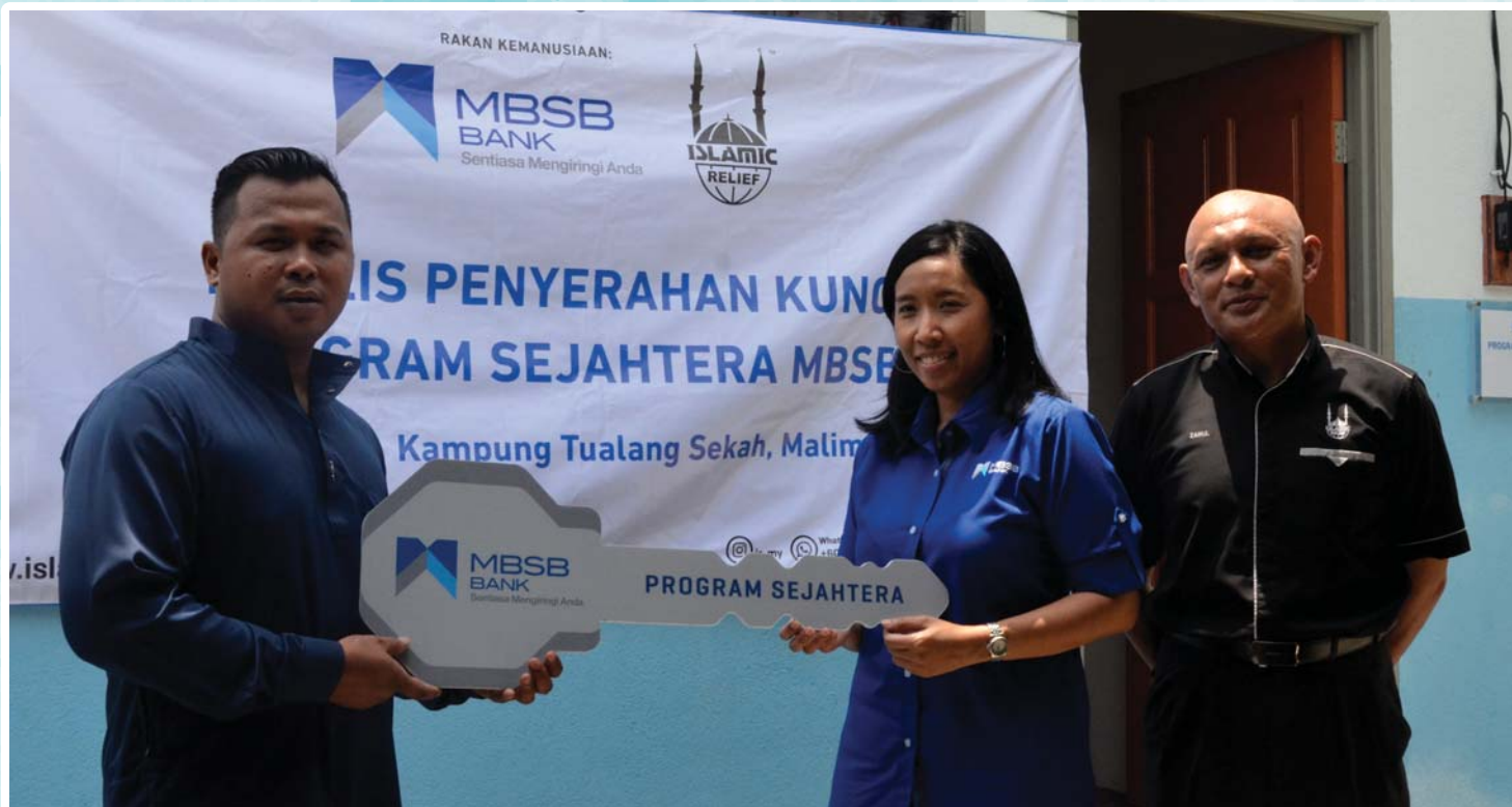
Mock-key handover to beneficiary by MBSB Bank Berhad and IRM