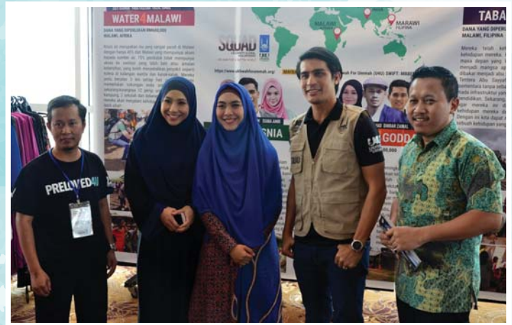
Squad Celebrity Global Volunteers taking part in the event

Apart from the 12 celebrities in the Squad Celebrity Global Volunteers, a total of 20 local artists were also involved in contributing their personal items to auction and to be donated to the Squad Celebrity including Dato' Siti Nurhaliza and many more.