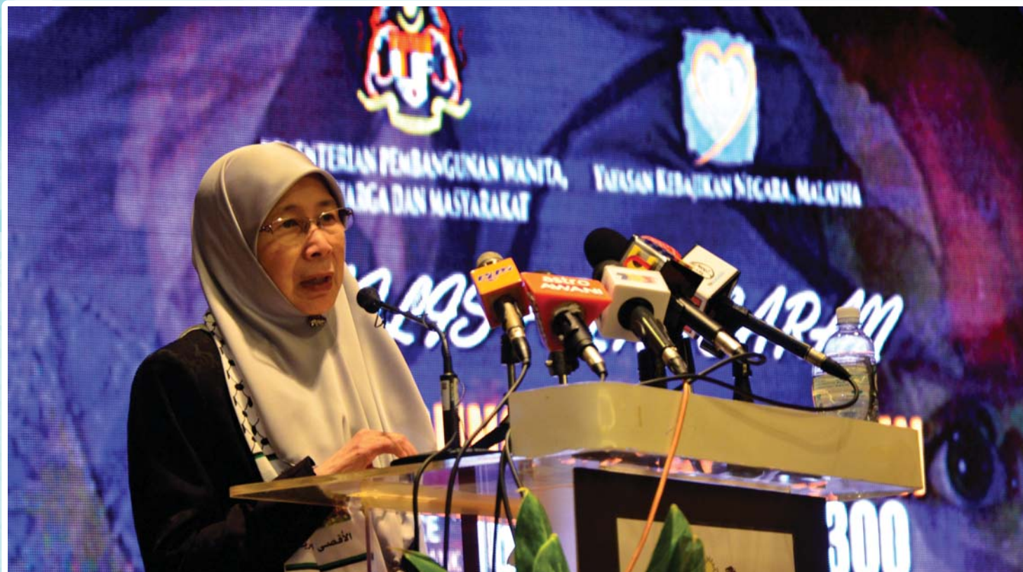
Datuk Seri Dr. Wan Azizah giving speech at Palestine Fund Launching Ceremony

Islamic Relief Malaysia [IRM] as an international humanitarian organisation was nominated as one of the implementing partners for Palestine Fund campaign alongside a local non-government organisation, MyCARE.