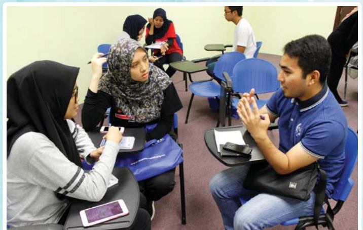
Volunteers having group discussion

Each phase serves to facilitate the implementation of programmes where the first phase emphasises the concept of assessment before helping out, the middle phase involves find out for the allocated aids, and the third phase is a distribution of aid to beneficiaries.