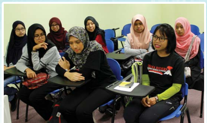
Volunteers listening to presentation