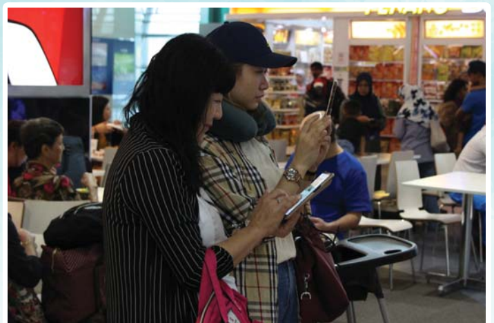
Spectators impressed with the performance by Afad & Friends