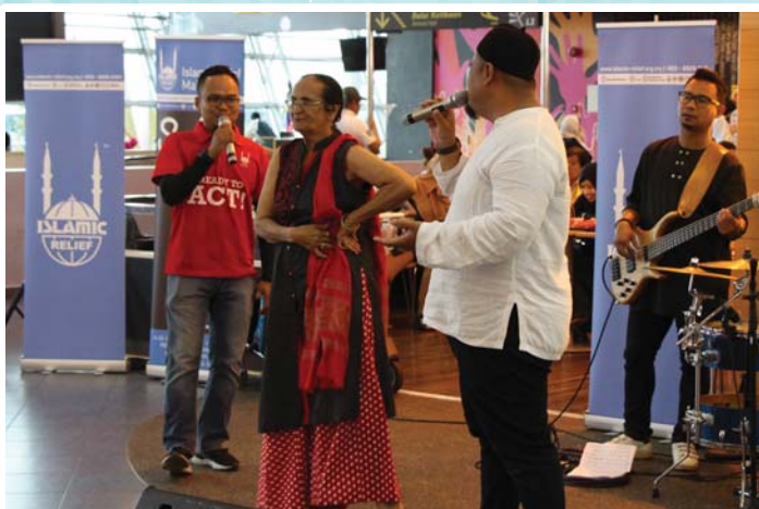
Audience from India joining the performance