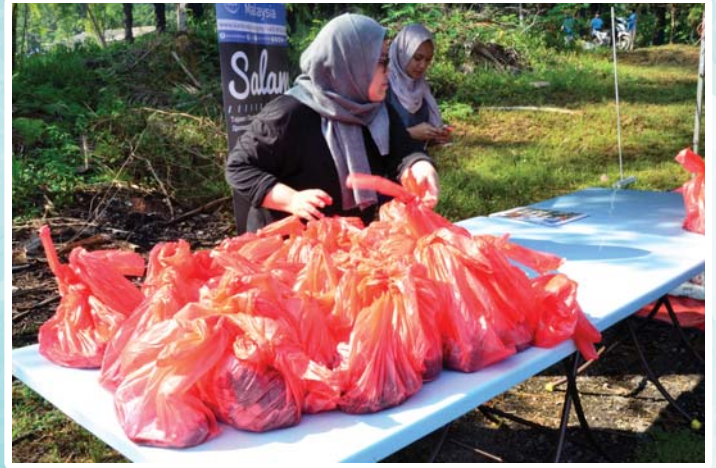
Packed Qurban meat to be distributed to beneficiaries