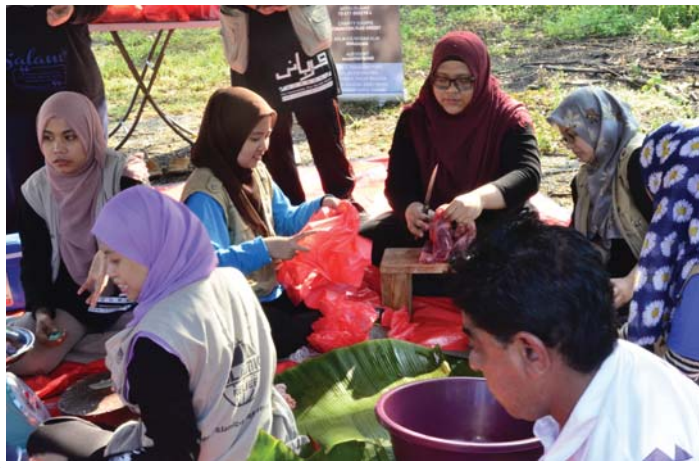
IRM staff working on-ground during Qurban Perdana 2018