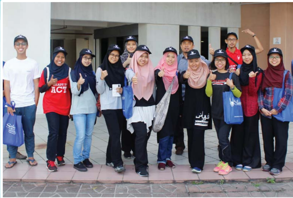
IRM Volunteers ready to embark on a new journey

13 volunteers of Islamic Relief Malaysia (IRM) involved in groundwork assessment alongside the family of IRM through Crafting Love and Care Programme at Lembah Subang Public Housing Programme.