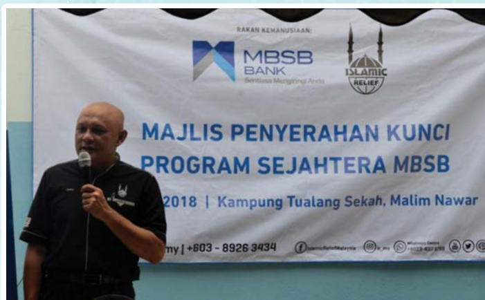
IRM Chief Executive Officer giving speech to the residents

IRM also hopes that such humanitarian works can go on continuously for the benefits of those in need in the future.