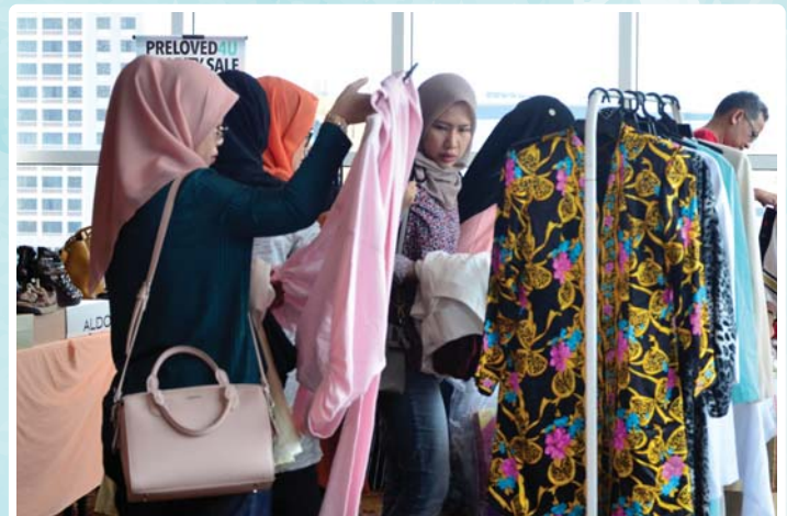
Pre Loved Items Sales at Tamu Suite & Hotel