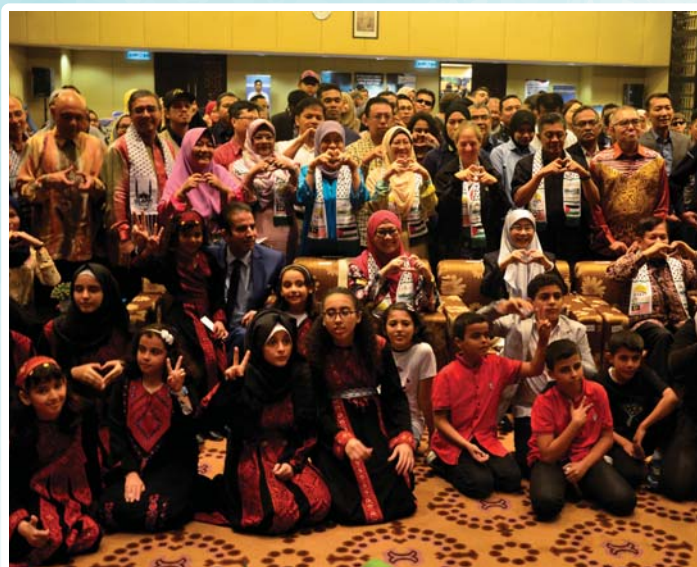
Palestine Fund Campaign officiated by Datuk Seri Dr. Wan Azizah

Dr. Wan Azizah hopes supports from the public, corporates, agencies and media organisations could make the campaign a success.