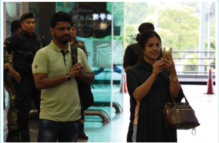
Among the spectators enjoying the busking