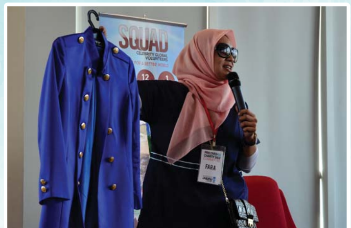
Exclusive item sold at auction