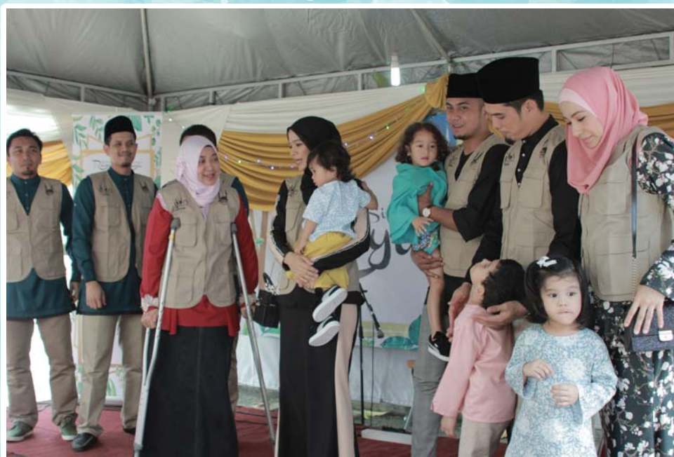
New Line of IRM Humanitarian Icons